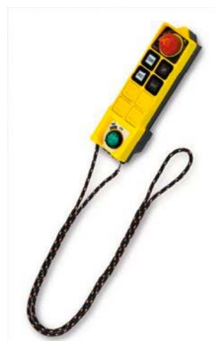
Optional: Radio remote control